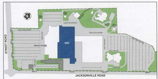
North American Technology Center

690 Jacksonville Road, a 210,000 square foot warehouse/light industrial/assembly facility within the NATC complex, provides the space and flexibility for today's operational requirements. High ceiling rental units are available from 70,000 sq. ft. and larger with offices and loading to suit.