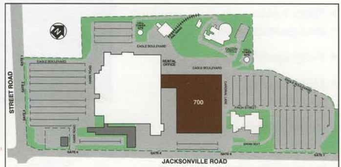
North American Technology Center

700 Jacksonville Road, a 214,000 square foot warehouse/light industrial/assembly facility within the NATC complex, provides the space and flexibility for today's operational requirements. High ceiling rental units are available from 40,000 sq. ft. and larger with offices to suit.